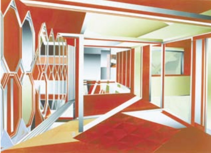
Martin Kobe, Untitled , 2003, Acrylic on canvas, 64.75 x 90.63 in. Courtesy of the Rubell Family Collection, Miami

Continue through this gallery and locate this painting by Martin Kobe.