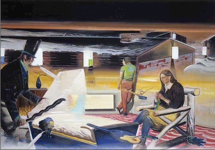
Neo Rauch, Das Neue , 2003, Oil on canvas, 82.5 x 118.25 in.

Locate Neo Rauch's painting, Das Neue , in this gallery.