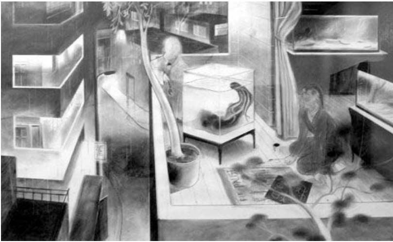
Tilo Baumgärtel, Die Pause (The Pause) , 2004, Coal on paper, 62.5 x 102 in.

Walk to the opposite side of the temporary wall that is centered in the gallery. There you will find Tilo Baumgärtel's drawing, Die Pause .