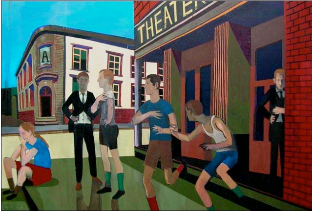
Christoph Ruckhäberle, Theater , 2003, Oil on canvas, 74.75 x 110.25 in.

Cross through the Frye Founding Collections Galleries and continue east into the Greathouse Galleries to see Christoph Ruckhäberle's painting, Theater .