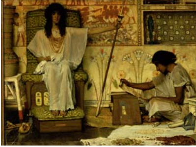
Lawrence Alma-Tadema Joseph, Overseer of Pharaoh's Granaries 1874 Oil on panel, 23 7/8" x 28 1/4" Dahesh Museum of Art, 2002.38