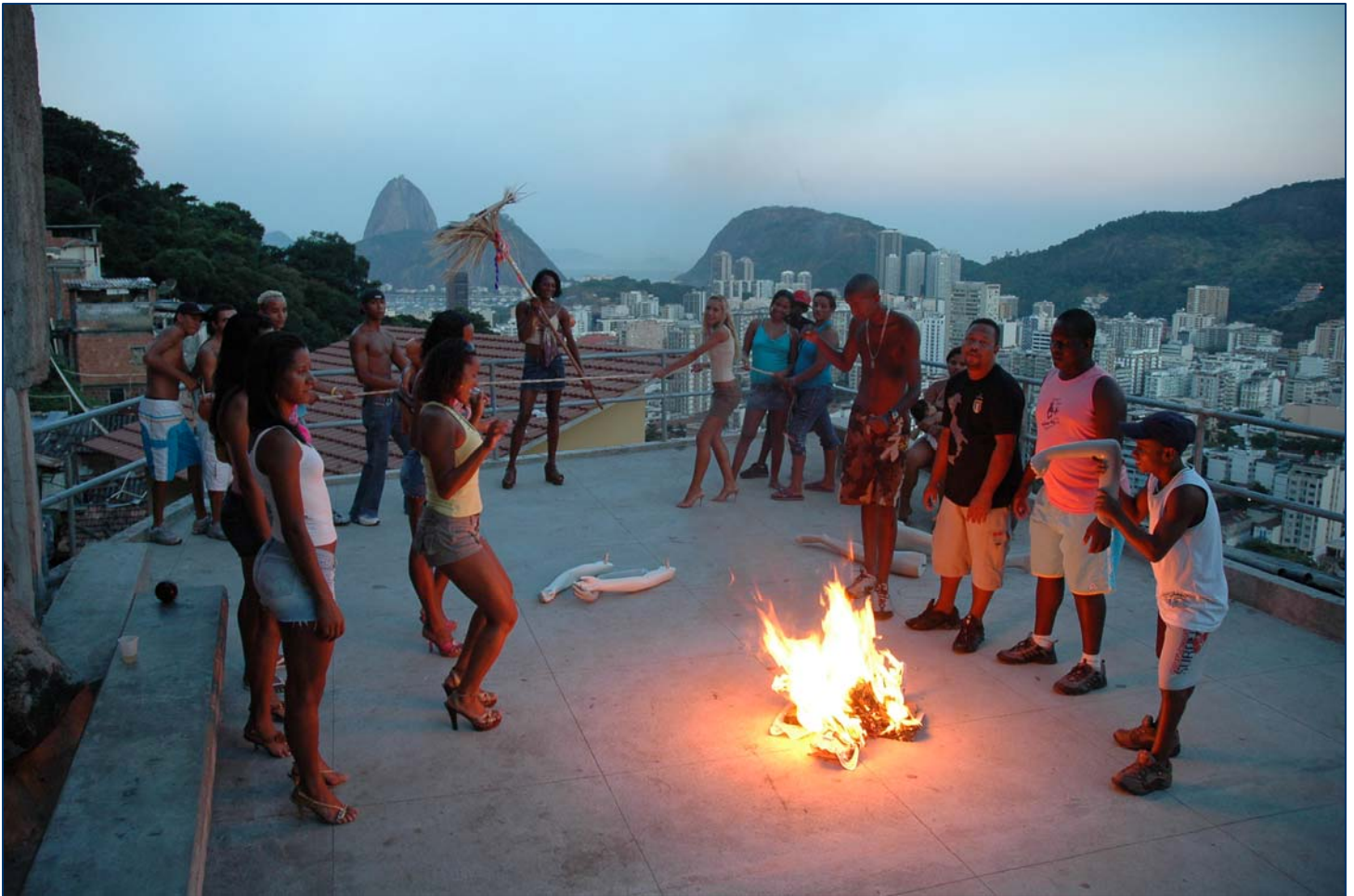
Dias & Riedweg. Funk Staden , 2007. Video installation. 10 x 46 x 46 ft.