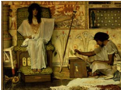
Lawrence Alma Tadema Joseph, Overseer of Pharaoh's Granaries 1874 Oil on panel, 23 7/8" x 28 1/4" Dahesh Museum of Art, 2002.38

Rudolf Ernst was an Austrian Orientalist painter who focused on harem scenes and images of daily life in the Orient. Sketches from his travels to Morocco and Turkey served as inspiration for his work, as did photographs and prints. Ernst often combined architecture, artifacts, and dress of many different cultures into one painting in order to create extremely exotic images for his European audience.