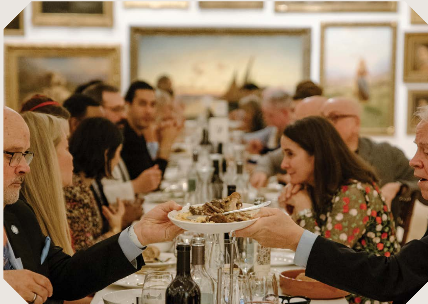
Guests at Salon Supper.