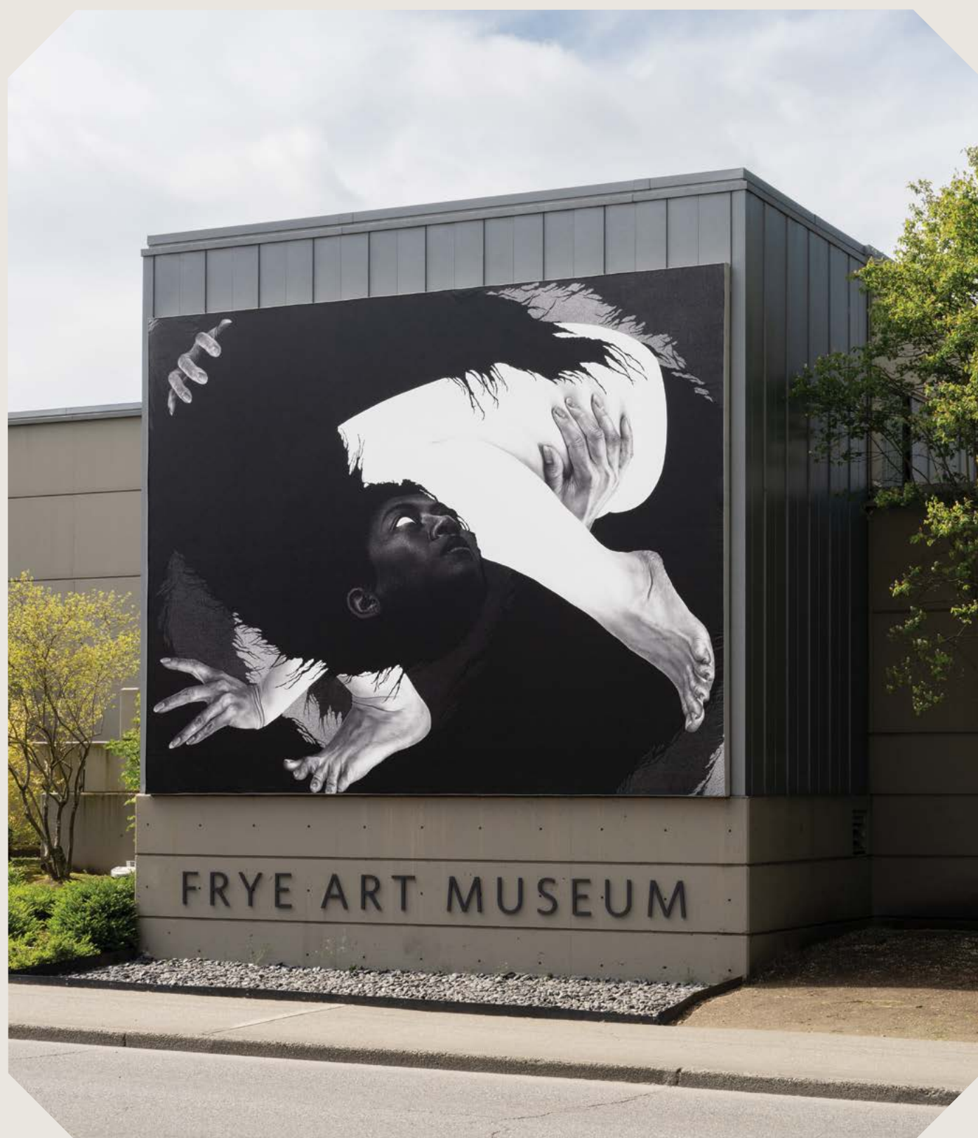
Installation view of Boren Banner Series: Samantha Wall , Frye Art Museum, April 10–October 6, 2024.