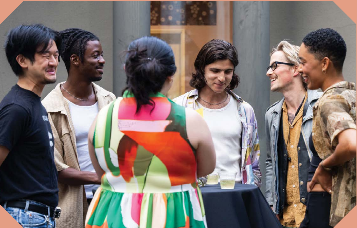
Frye Nouveau guests enjoy drinks in the courtyard.

This summer, new friends and familiar faces turned out in style and record numbers to celebrate the launch of Frye Nouveau, a new member group for emerging artists, young professionals, and adventurous supporters age 21+ to connect with kindred spirits after hours at the museum. Sign up for Frye Nouveau today (open to members at the Aficionado level and above) and join our next quarterly event!