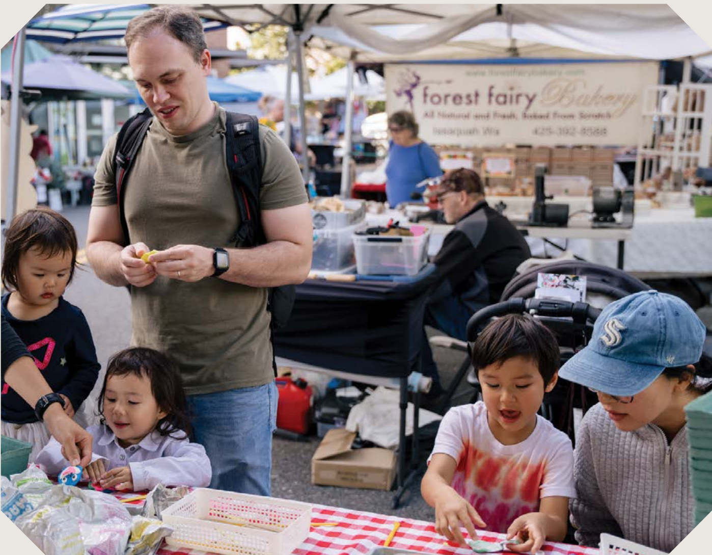
Family art-making activity at the Burien Farmers Market.

This summer, the Frye “popped up” at farmers markets across South Seattle, bringing family-friendly, hands-on art making fun to market shoppers and introducing many new friends to Seattle’s only free art museum. It was a wonderful way to meet new communities where they live —got an idea to bring the Frye into your community? We’d love to hear it!