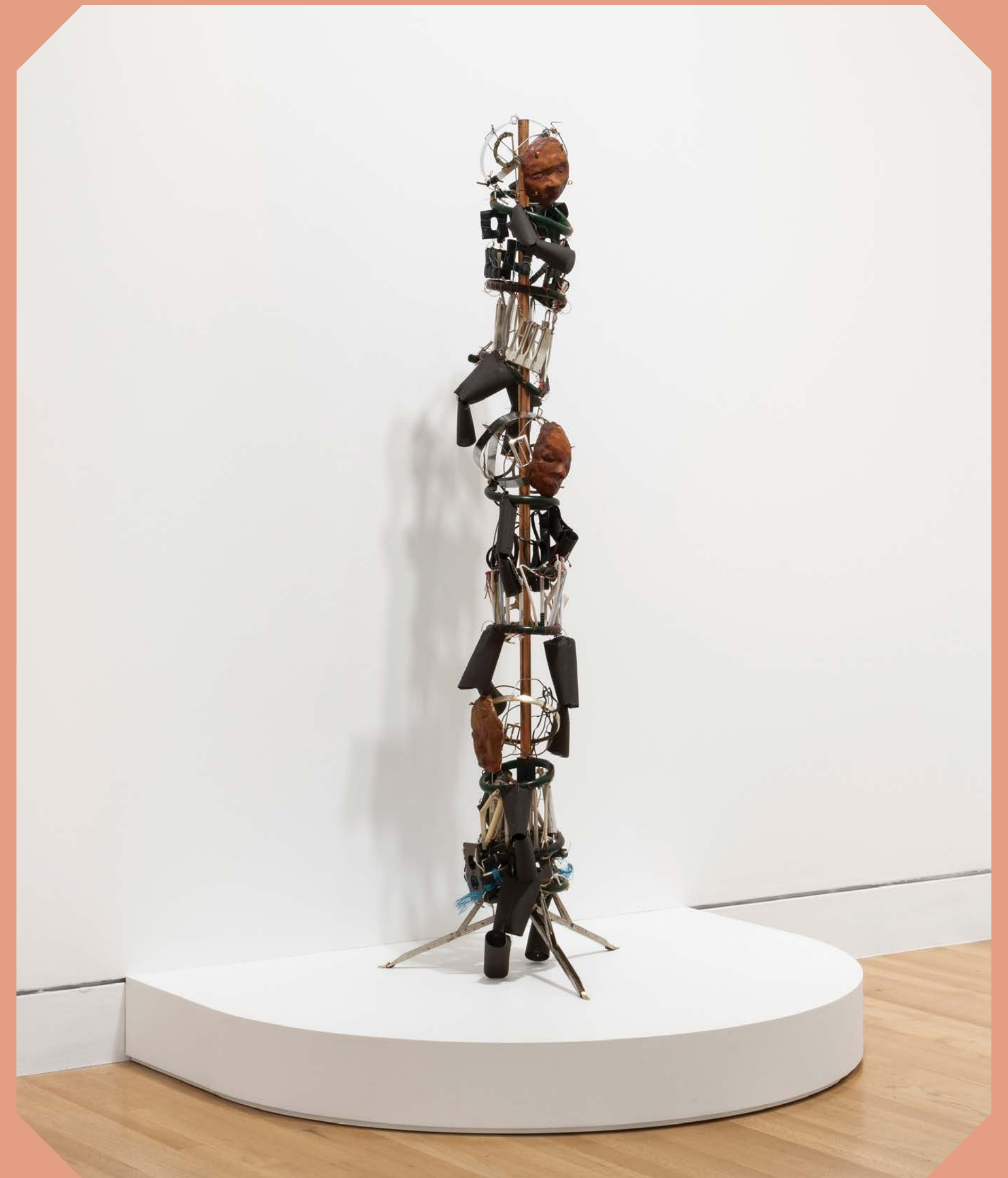
Marita Dingus. Sister Totem , 2023. Ceramic and mixed media. 67 x 19 x 19 in. Museum purchase with funds provided by Lucy and Stuart Williams, 2024.005.